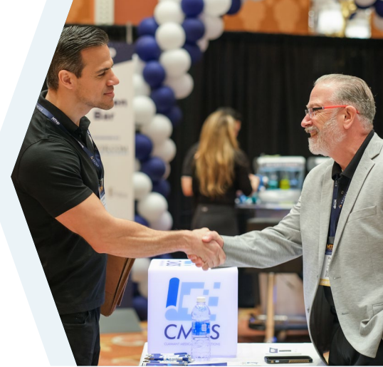
EXHIBIT BOOTH INCLUSIONS

Foyer Booths: 6-foot skirted table; two chairs; wastebasket; space is 8x8 and all signage must adhere to this exact size. Signage is restricted to 8x8 total space.