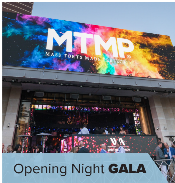
Opening Night GALA