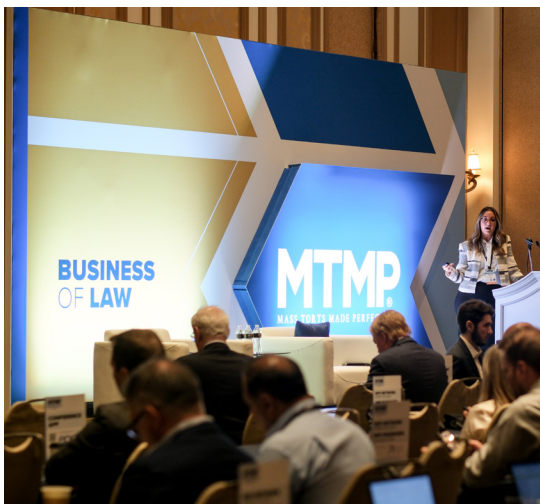
Sponsor 5 DIFFERENT EDUCATIONAL Tracks