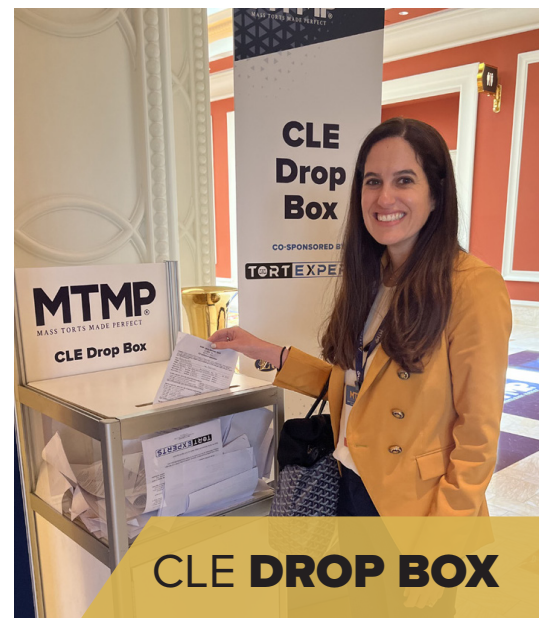
CLE DROP BOX