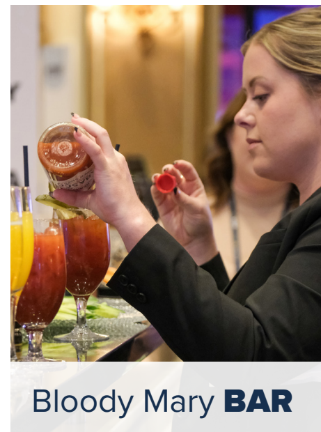
Bloody Mary BAR